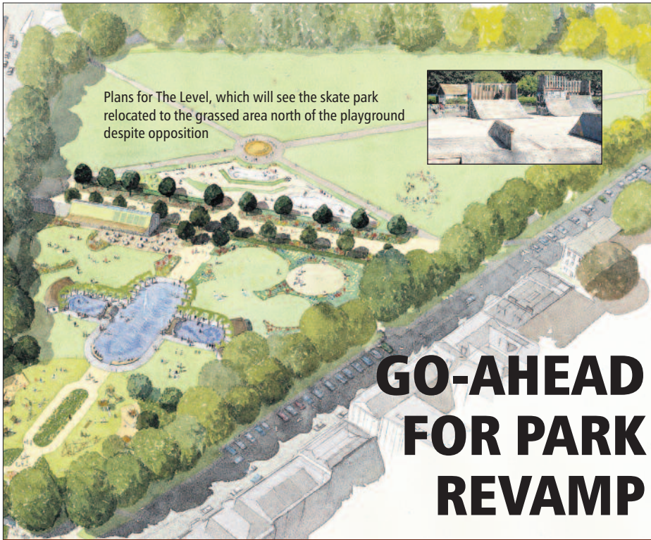
Plans for The Level, which will see the skate park relocated to the grassed area north of the playground despite opposition