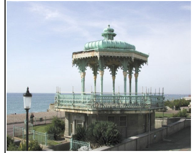
The Bedford Square Bandstand to be renovated at last

Work is now expected to begin later this summer and should be completed by early next year.